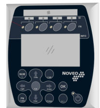
Keypad ,LCD display