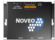
Noveo-AIR™ Centris micro-controller